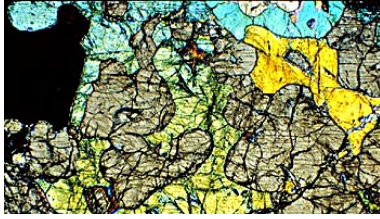
Slika 11 Aliotriomorfna struktura - skoraj vsa zrna so ksenomorfna